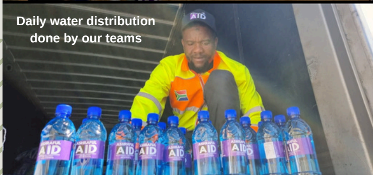
Daily water distribution done by our teams