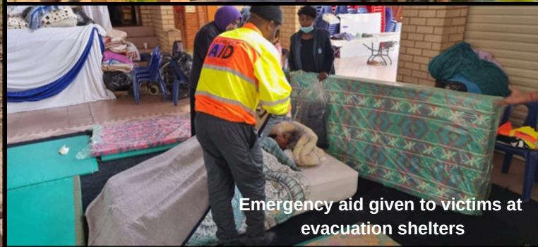
Emergency aid given to victims at evacuation shelters