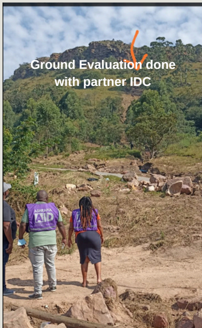
Ground Evaluation done with partner IDC

During this time of great devastation Ashrafal Aid has focused on providing essential services such as food security, hot meals and water relief to the people KZN and its rural areas. In addition, we have further provided emergency assistance in this natural disaster and have supported the recovery and reconstruction efforts of affected communities