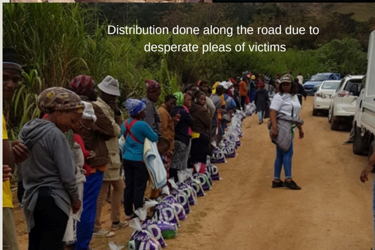
Distribution done along the road due to desperate pleas of victims