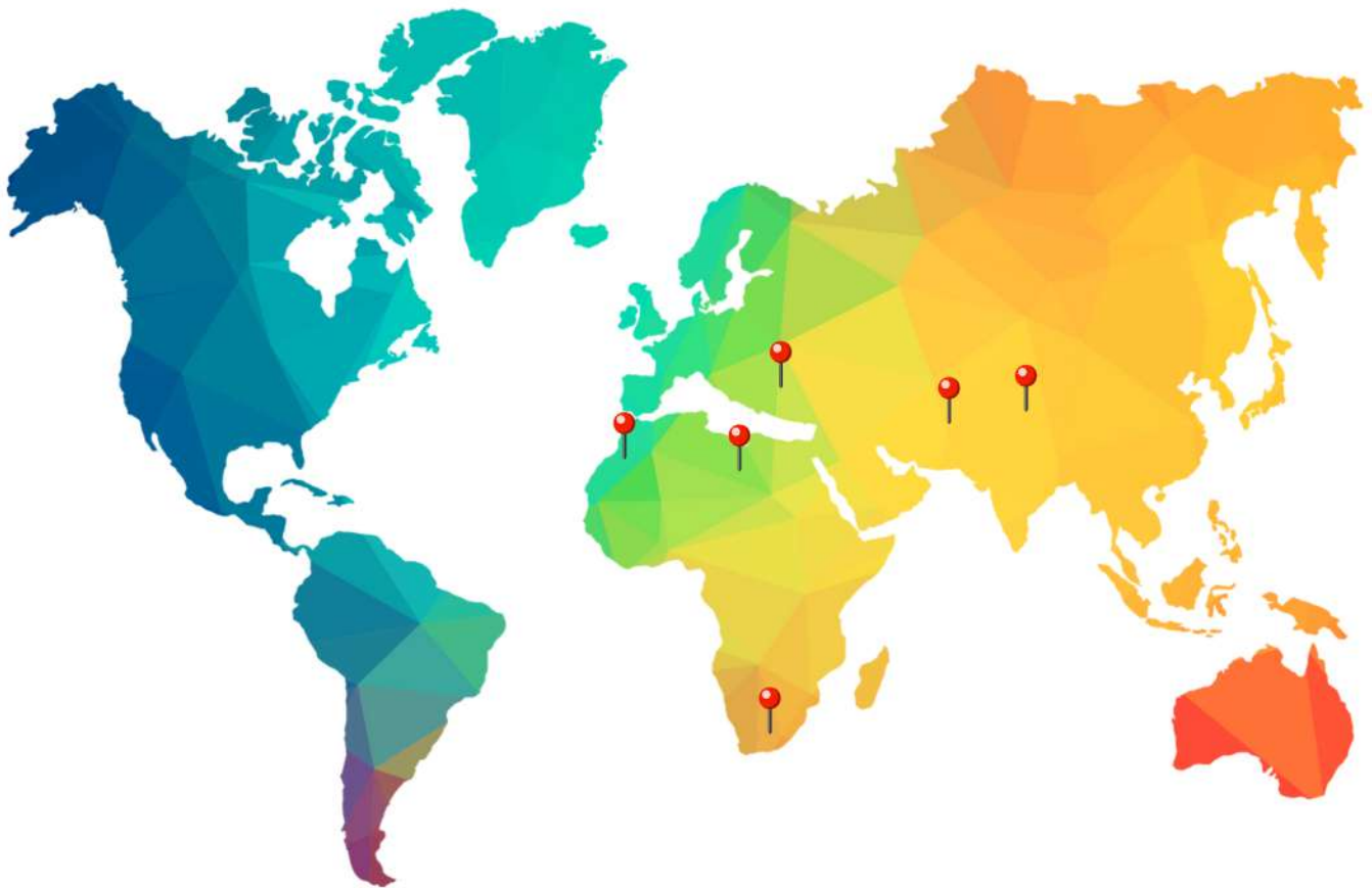
Countries where Ashrafal Aid provided disaster relief in 2024.

Ashrafal Aid's Disaster Relief Programme continues to be a beacon of hope for communities affected by natural disasters and crises. Over the past year, our rapid response teams have provided critical support in the aftermath of earthquakes in Morocco, floods in Sri Lanka and Afghanistan, and local disasters in South Africa, including assistance to Wits University students during a power outage. Our efforts have encompassed the distribution of essential aid such as food, water, medical supplies, and hygiene kits, as well as providing shelter and support to displaced individuals. Through these actions, Ashrafal Aid remains committed to delivering timely and effective humanitarian assistance to those in need.